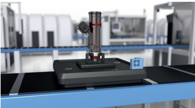
RFID tag attached to a workpiece carrier, containing data about the production sequence for the workpiece

In an assembly process it is important to always be able to track vendor and lot information for all the installed components. When the need is for highly flexible production on a line consisting of various product versions, RFID tags on the workpiece carriers (or on the product itself) will help you by monitoring and controlling. RFID makes batch size 1 possible in mass production.