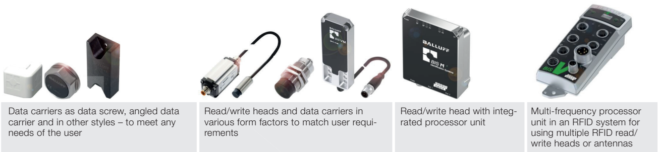
Data carriers as data screw, angled data carrier and in other styles – to meet any needs of the user

If an error is discovered, an error code is written to the RFID tag which is then identified by the RFID read/write head at the next work step. The defective WIP can then be shunted out and reworked.