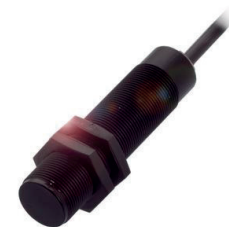
Capacitive sensor for distance measurement of all materials up to approx. 50 mm

Distance measurement is a common task for sensors. Various kinds of sensors are used in industry which vary in their technical principles: