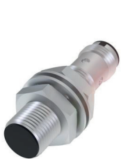
Inductive sensor for measuring distance to metal objects up to approx. 50 mm

Disk brakes are used at various locations in wind power plants. With their durability and precise measurement, inductive distance sensors monitor these brake disks continuously and provide a timely warning if the brake linings need to be changed. In winding and unwinding equipment, a photoelectric sensor continuously measures the increasing or decreasing roll diameter regardless of roll material or color. This means the rolls can be changed with minimal stoppages.