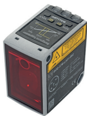
Photoelectric sensor for distance measurement of all materials from a few millimeters to several meters