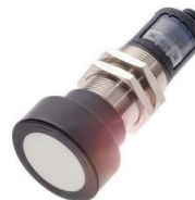
Ultrasonic sensor for distance measurement of all materials up to several meters