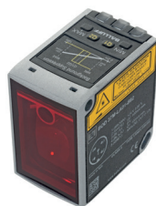
Photoelectric sensor for distance measurement of all materials from a few millimeters to several meters