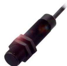
Capacitive sensor for distance measurement of all materials up to approx. 50 mm

Distance measurement is a common task for sensors. Various kinds of sensors are used in industry which vary in their technical principles: