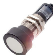
Ultrasonic sensor for distance measurement of all materials up to several meters