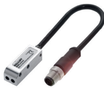
Precise, absolute and incremental magnetically coded travel and angle measuring system