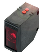
Photoelectric distance sensor measures distances regardless of color or surface properties of the object.

Each product technology has its own application focus areas: