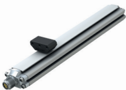
Precise magnetostrictive linear position sensor detects positions, travel and speeds.

With photoelectric measuring devices you determine the size and position of objects in the material flow of production lines. Neither the surface properties nor the color of the target object has any affect on the measuring quality.