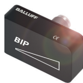
Inductive positioning system detects distances and positions at close range.