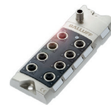
Sensor/actuator hub for connecting binary and/or analog sensors and actuators

The IO-Link-Master is the heart of the IO-Link installation. It communicates with the controller over the respective fieldbus as well as downward using IO-Link with the sensor/actuator level (gateway).