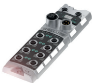
8-port IO-Link master for Profinet for connecting up to 8 IO-Link devices