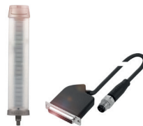
Selection of IO-Link capable intelligent actuators (here: signal light and valve interface)